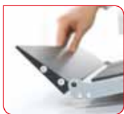
Integrated ramp folds up for troublefree transport.

After weighing, the seca 676 can be folded together in no time at all to save space. The sturdy locking device between rail and platform ensures the scale stands safely also when folded together. The rail also serves as handle when the scale is folded together, meaning that the seca 676 can be moved and stored away easily and quickly on the smooth-running transport castors.