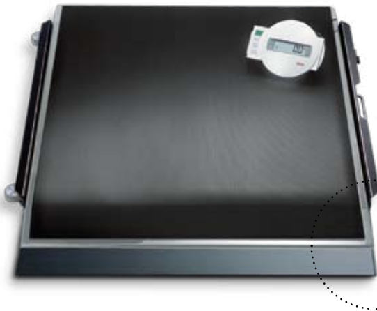
A ramp for easy roll-on of wheelchair is included in delivery.