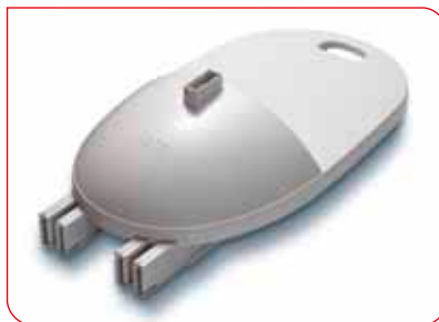
Integrated handle and secure catches on all individual parts for transport ease.