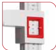
Two large windows and double-sided scale for easy readout.