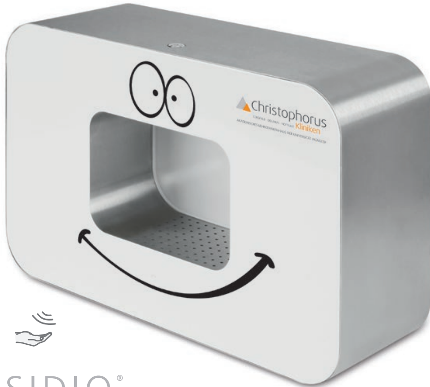
Customised front for Christophorus-Kliniken, Coesfeld