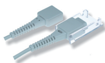
Extension cable DSUB-DSUB For handheld devices, 120 cm Order No. 00310

By using the Medlab probes, your budget for pulse oximetry is easy to plan: You can be sure that for 24 months, there will be no additional costs because of defective probes*.