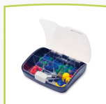
Ear tip kit