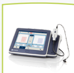
touchTymp with printer