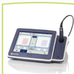
touchTymp with printer