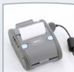
Wireless label printer