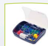
Sanibel eartip starter kit