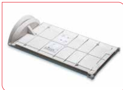
The high-quality folding mechanism guarantees a long service life.