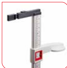
The spacer provides extra stability and ensures precise measurement results.