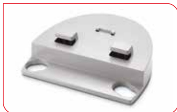
The seca 437 adapter element connects the stadiometer to a flat scale.